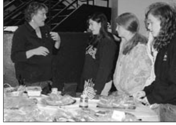
Election Day bake sale at SHS