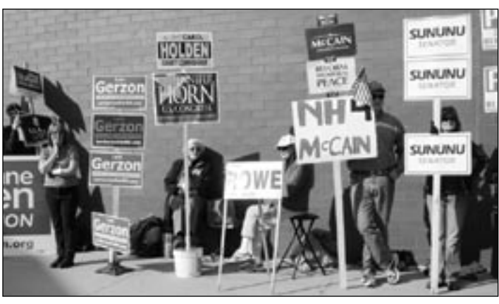
Candidates and supporters outside Amherst polls at SHS