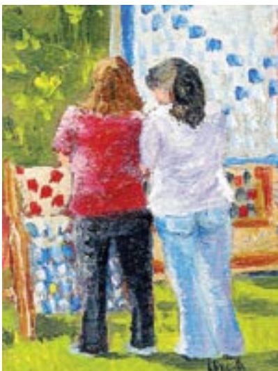
“Quilts for Sale” by Nita Casey