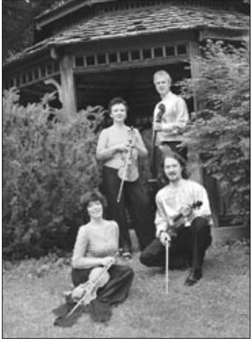
The St. Petersburg String Quartet performs for one evening only, February 19, at 7p.m.