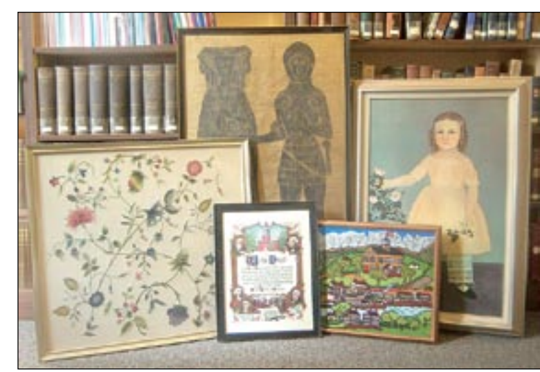
Examples of acquisitions to be auctioned off, June 1 through July 9.

Included in the exhibit will be the library's collection of original and historically significant paintings, photographs, needlework, prints and reproductions. Many pieces which were given as gifts, were displayed in the library for years, while others were part of circulation service, which is no longer offered.