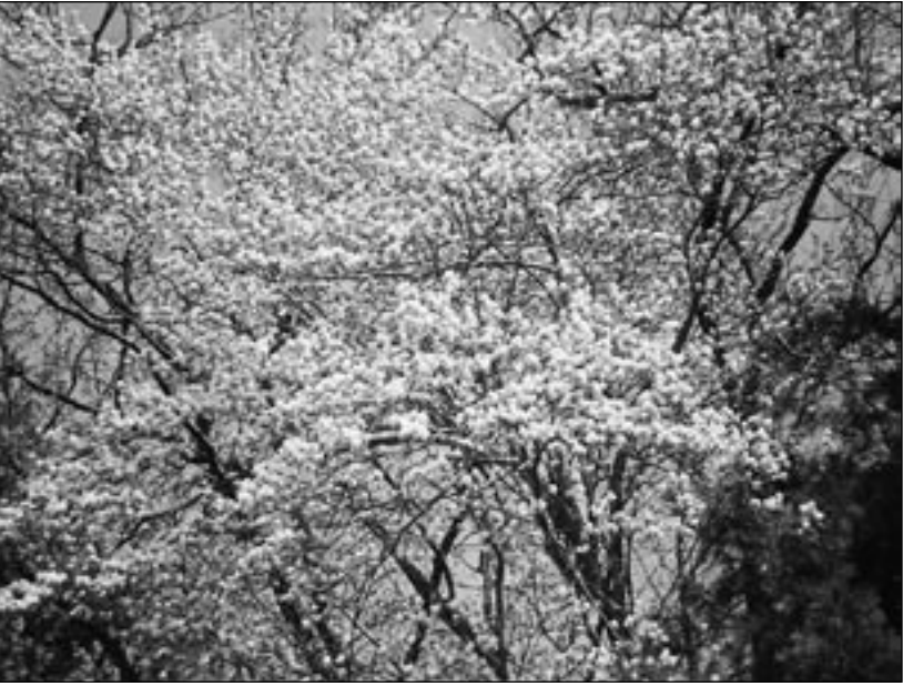
Giant Serviceberry tree along Souhegan River.