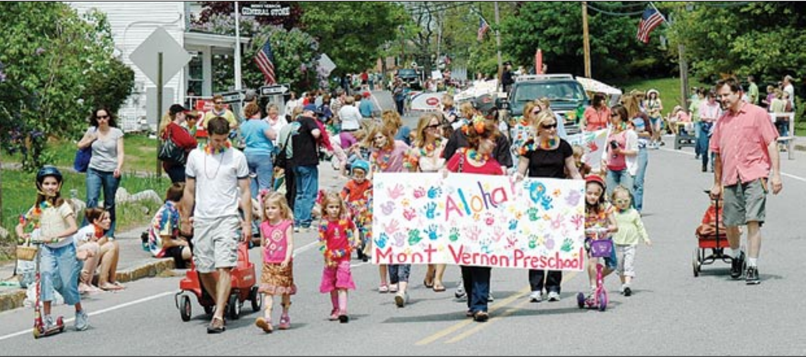
A Hawaiian theme was selected this year and was present everywhere from the parade to all the events throughout the day. More photos on page 14.