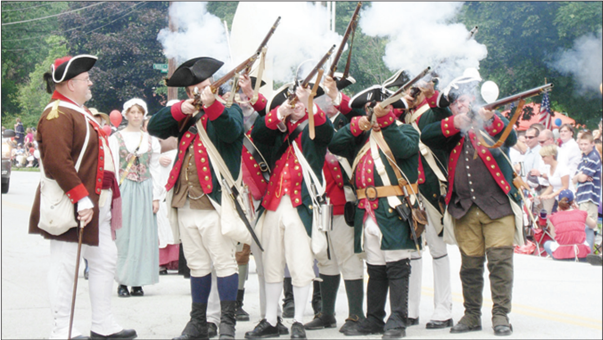
Always a favorite, Revolutionary soldiers firing their muskets.