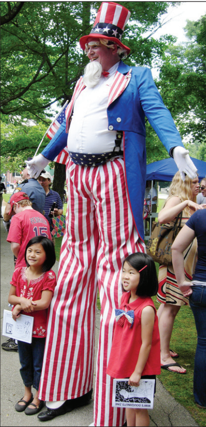
Uncle Sam was a stand out in the crowd on the Amherst Common.