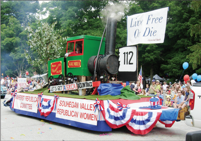
Beautifully decorated floats carried out this year's theme.