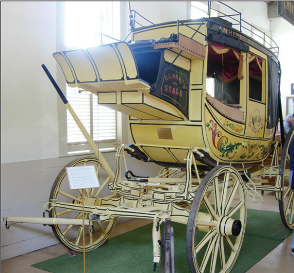
Amherst's Concord Coach at the Wigwag...