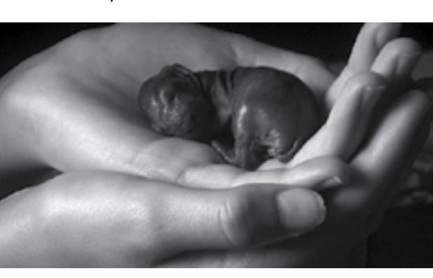
Marajka Knight / Photogrpahy: Life In My Hands / Gold Key