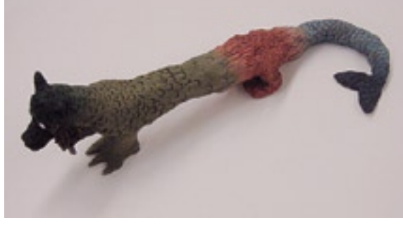
Tina Huang / Sculpture: Mystic A / Silver Key