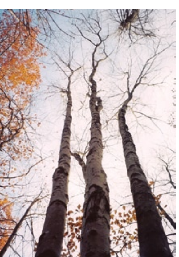
Elizabeth Hosage / Photography: The Three Sentries /