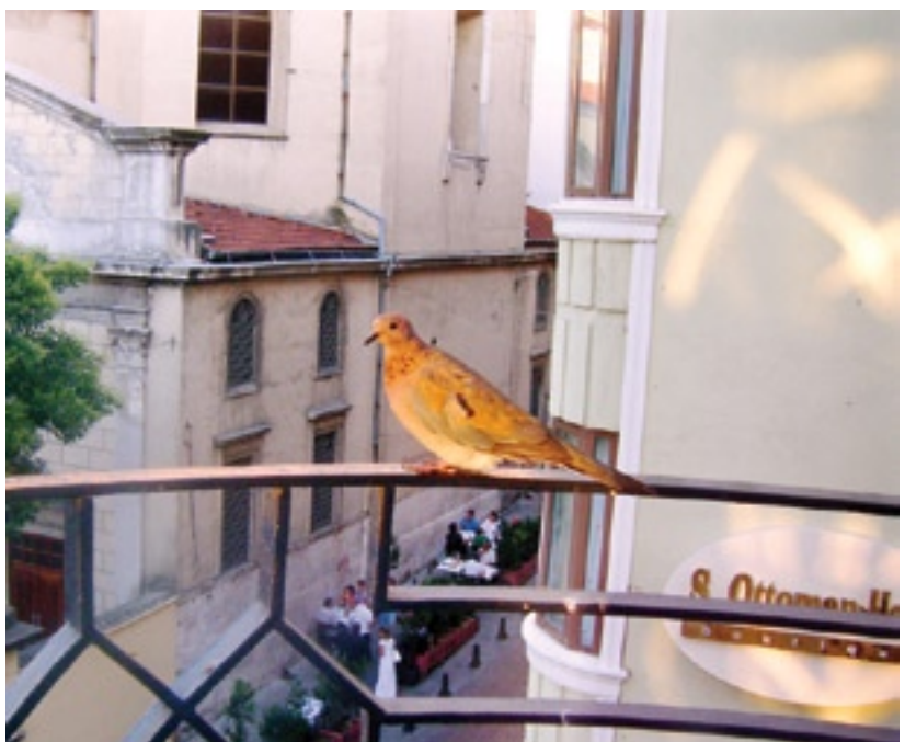
Elizabeth Chiappini / Digital Photography: Morning Dove / Gold Key