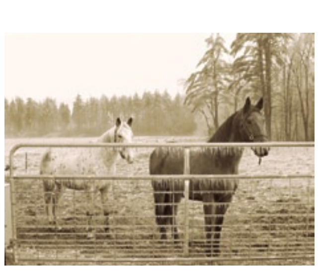
Marajka Knight / Photography: Ice Storm Horses / Silver