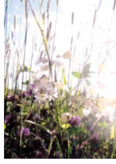
Jacob Sipos / Photography: Light / Honorable Mention

Congratulations to the following students whose work received recognition in the annual Scholastic Art and Writing Awards of NH: