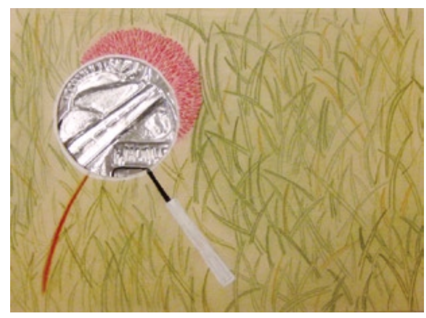
Sarah Regan / Mixed Media: Investigation / Honorable Mention