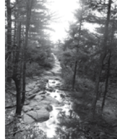
Pathway / Honorable Mention