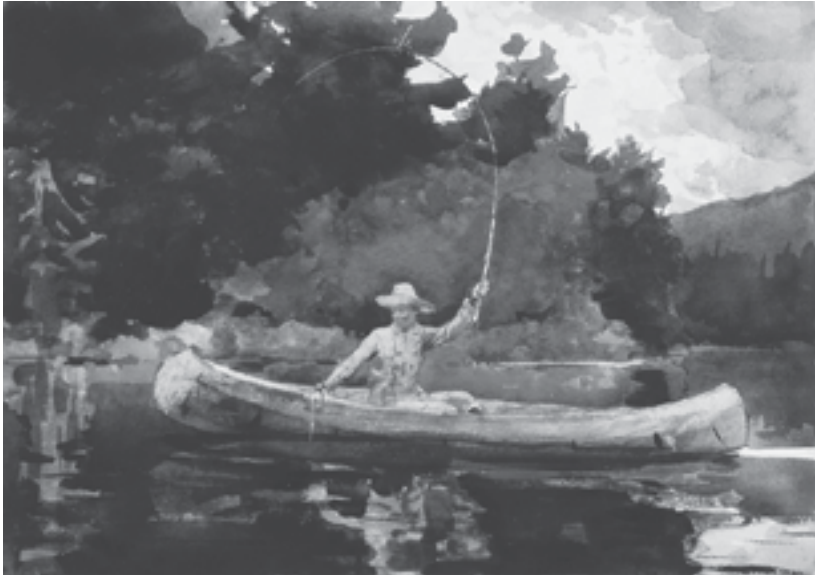
The North Woods (Playing Him), Winslow Homer, 1894