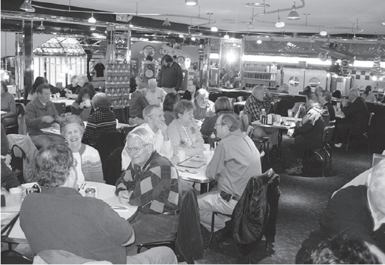
A packed house at Joey's Diner waiting for Ron Paul's arrival, Wednesday, December 14.

He makes his case that conservatives should be voting for less government not more.