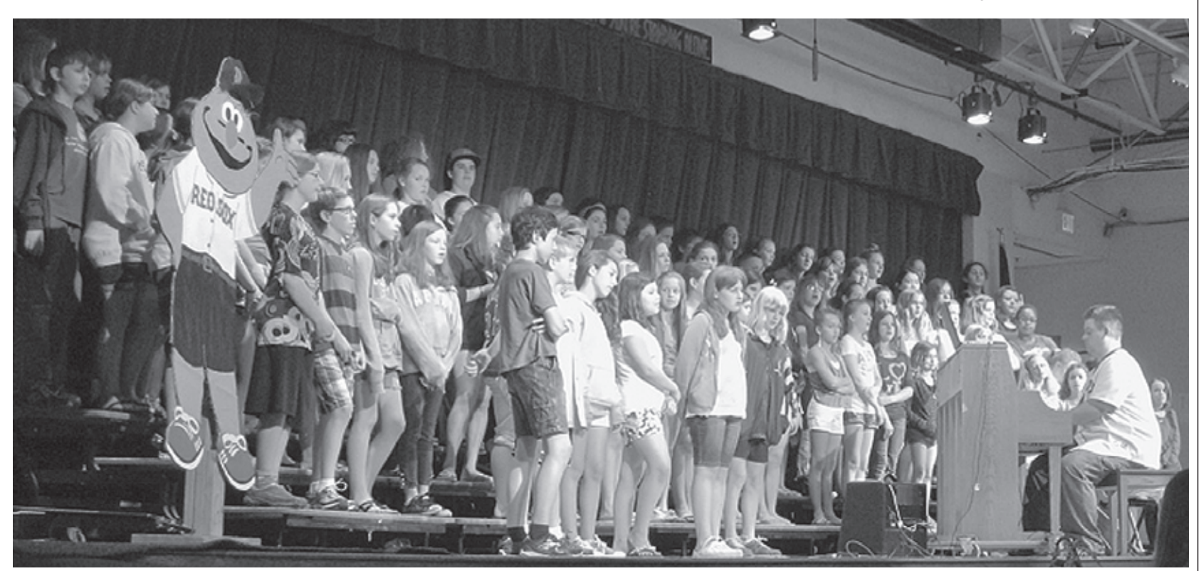
The photograph attached is from the in-school performance on May 30th.

Amherst Middle School 5th and 6th grade chorus students recently presented two baseball-themed concerts to celebrate the 100th anniversary of Fenway Park.