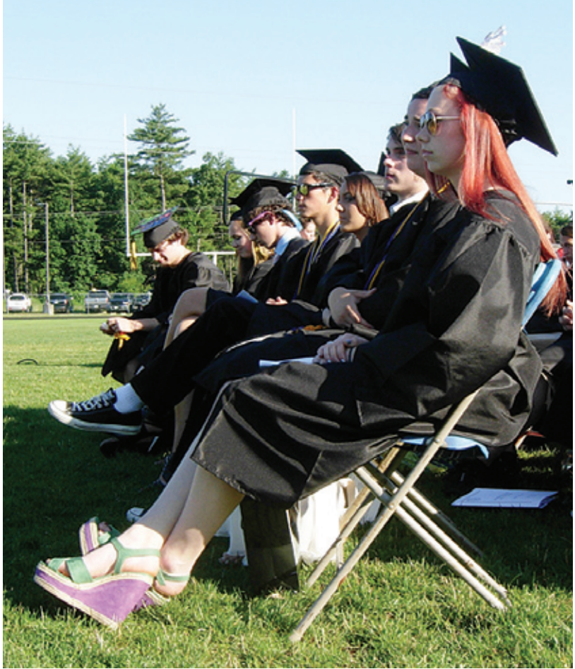
Students in advisory waiting their turn