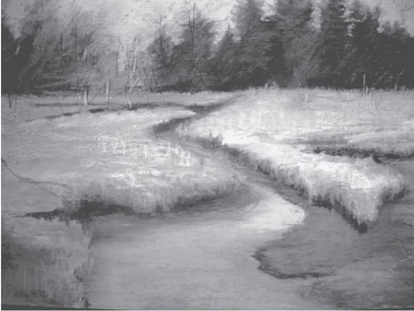
"Clear Journey" will be one of the paintings on display at the Library.