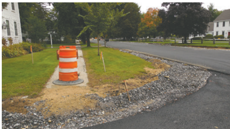
Progress: Corner of Boston Post Road and Cross Street, Amherst Village