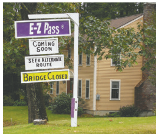
Resident offers comment on bridge closing