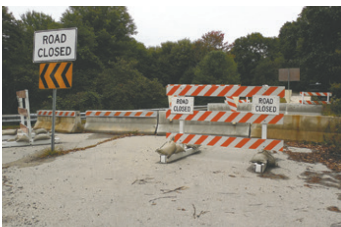
Barricades and detour signs remain in place... for now