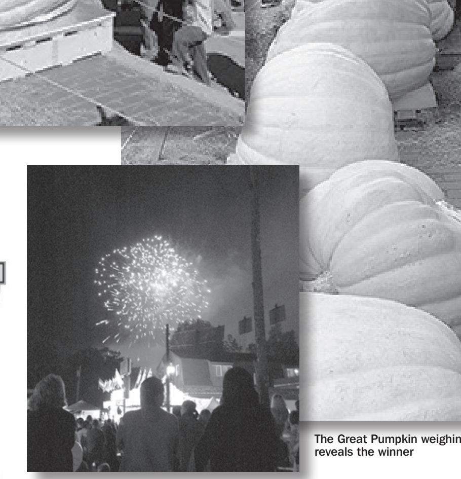
Watch the fabulous fireworks display Friday night.