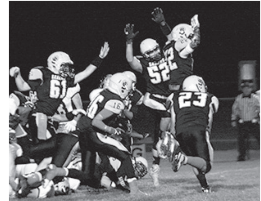
Sabers block point after kick