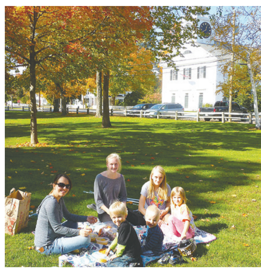
Perfect day for a picnic on the Common.

The concert is free and open to the public but tickets, available at the library, are required due to limited seating.