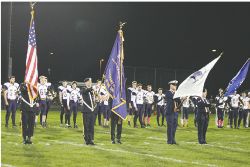
Con-Val Football Team with color guard