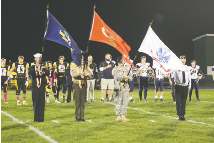
Color guard with Souhegan Football Team