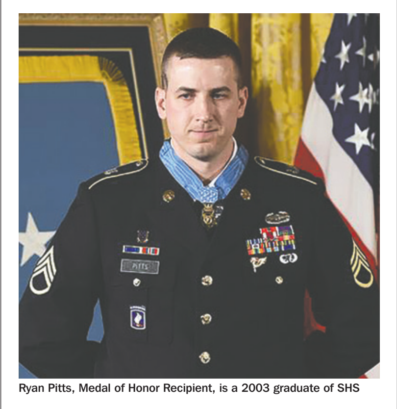
Ryan Pitts, Medal of Honor Recipient, is a 2003 graduate of SHS