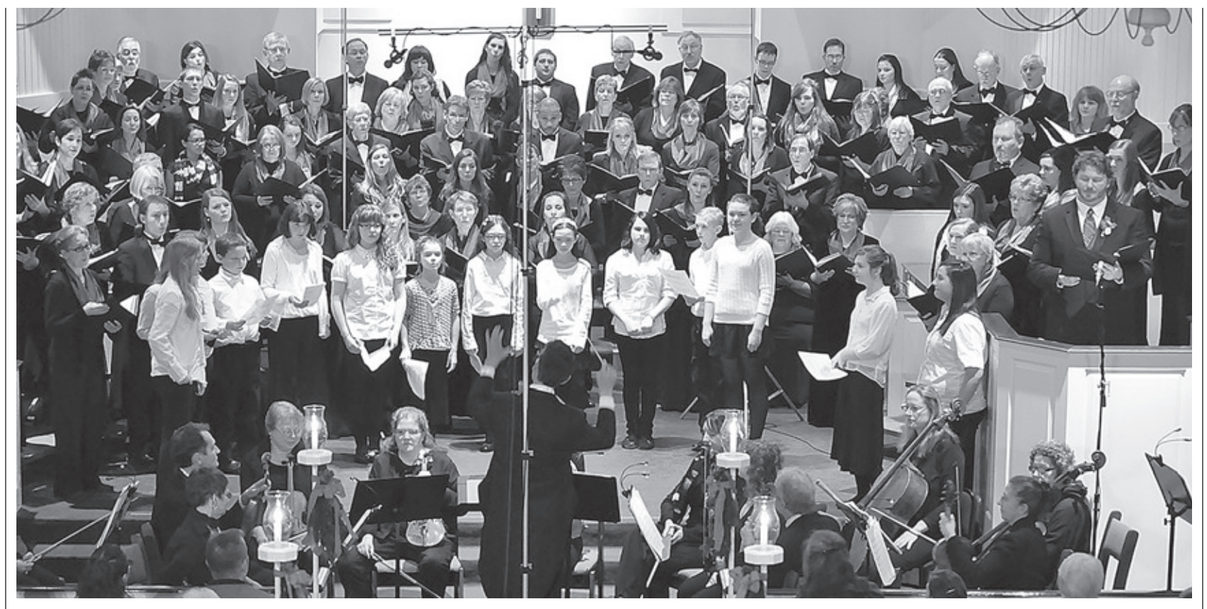
The 2G MCS youth chorus joins in performance with the Manchester combined chorus and orchestra at last year's Christmas concert. This year, the concert will be performed twice; on Saturday, December 13, at 7 p.m. at the Derryfield School, and Sunday, December 14, at 3 p.m. at Grace Church, both in Manchester, NH.

Directions: 101 East to exit 3 (Candia Deerfeild) go straight through the stop sign and Frisella Fine Art Studio is the first building on your left, behind Stubby's Diner.