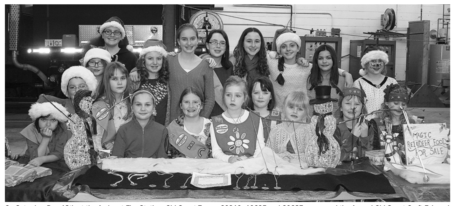
On Saturday, Dec 13th at the Amherst Fire Station, Girl Scout Troops 20910, 10695 and 20687 sponsored the Annual Girl Scout Craft Fair and Cookie Sale! All crafts and cookies were homemade and even Santa came to visit to take pictures with all that came!

St. Joseph Healthcare Welcomes New Gynecologic Practitioners