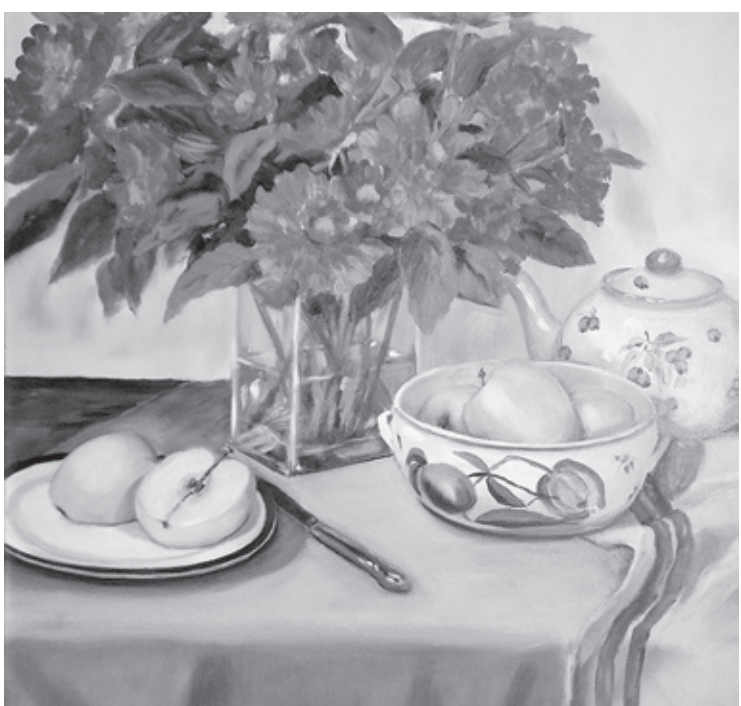
Jackie Cunningham, "Yellow Apples", 18