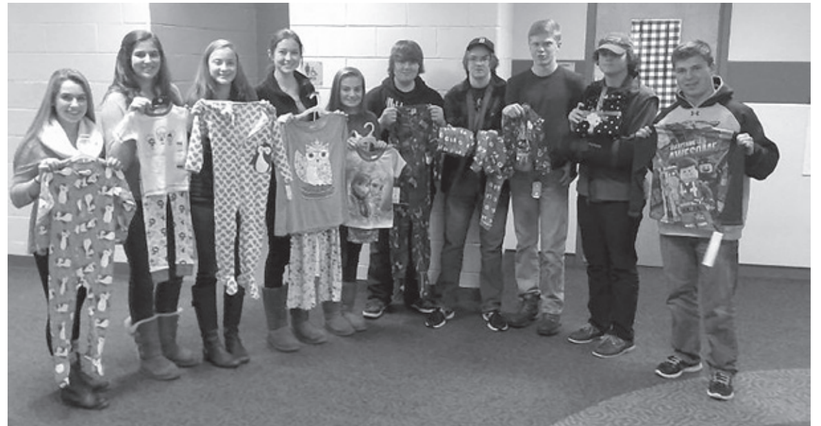
"The Amherst Preschool, along with a Souhegan High School advisory, collected over 150 pairs of pajamas for the Pajama Program! These pajamas were distributed to both SHARE in Milford and Families in Transition in Manchester.