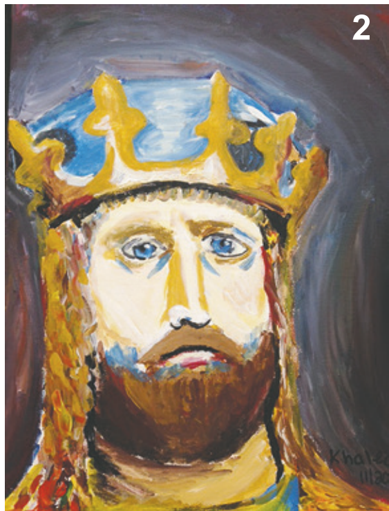
"Untitled" by Khaled Nazeer