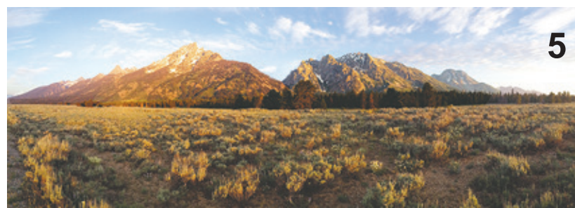
"Grand Tetons" by Camden Fitz