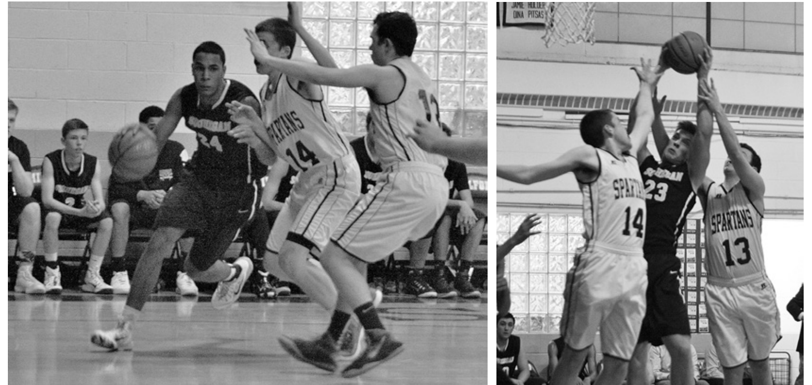
The Souhegan vs Milford boys's basketball was an exciting up and down the court contest from the opening tip until the contest ended with an excellent Souhegan Sabers victory

Souhegan: 4 Wins, 6 Losses With 7 Games To Go