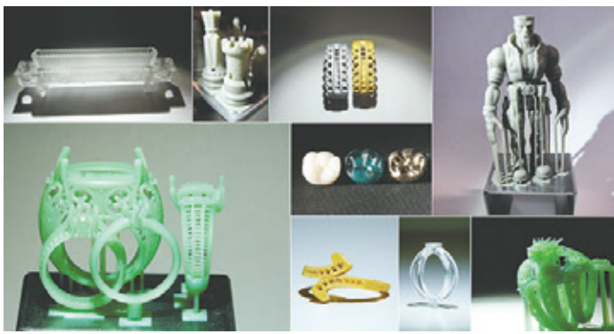
Collage of 3D Systems examples

AMHERST - The Amherst Town Library is proud to announce that it has been awarded two competitive grants in order to bring 3D printing technology and training to the Amherst library, schools and community clubs and organizations.