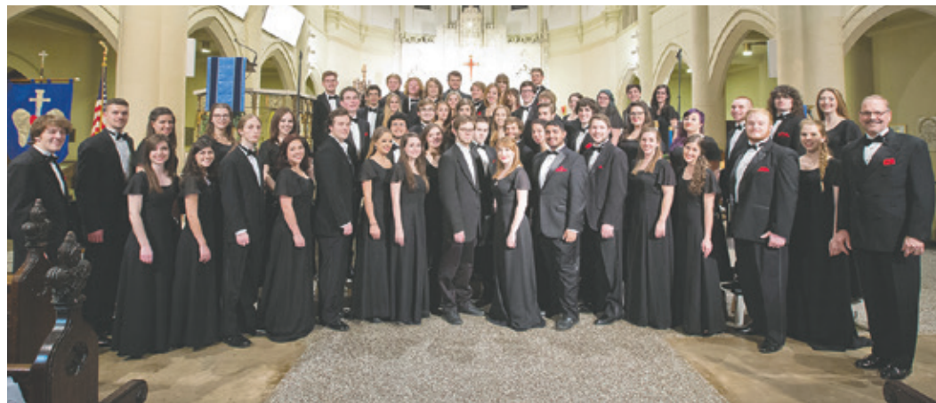
Rhodes Singers from Memphis will perform March 11 at the Congregational Church of Amherst

Overnight housing is needed for the students on the night of March 11 - please call the church office at 673-3231 or Peter Labombarde at 714-2322 if you can help.