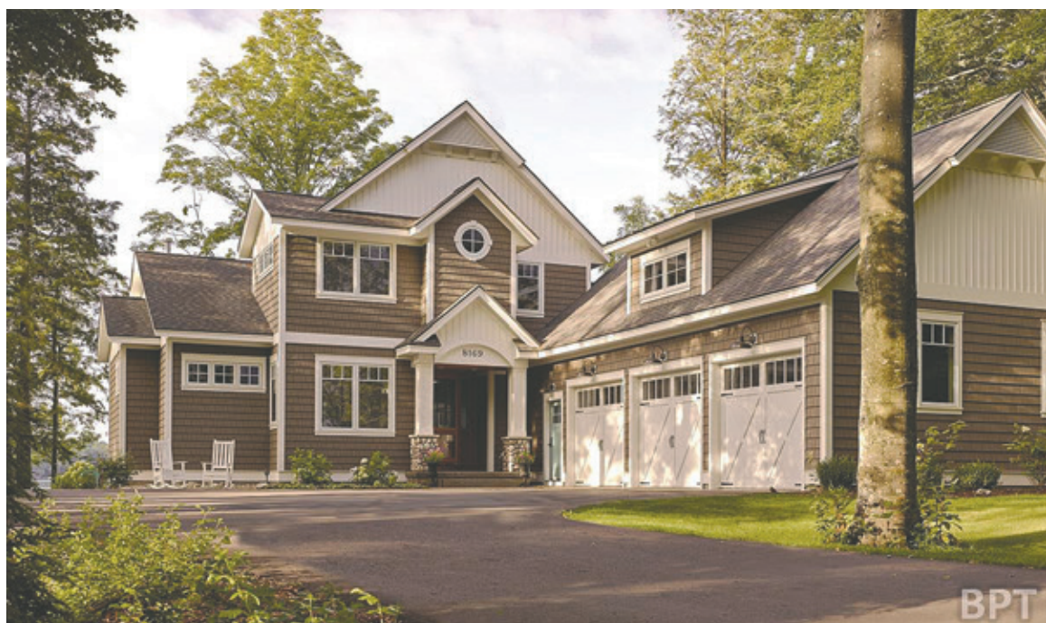
With vinyl siding like Mastic Home Exteriors by Ply Gem, shown here, homeowners can choose from multiple textures and colors to create beautiful, low-maintenance curb appeal, with overall better performance than wood, engineered wood and fiber cement and a high return on investment.