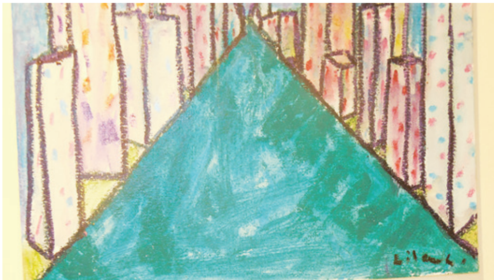
Lila Leonard, AMS – grade 7