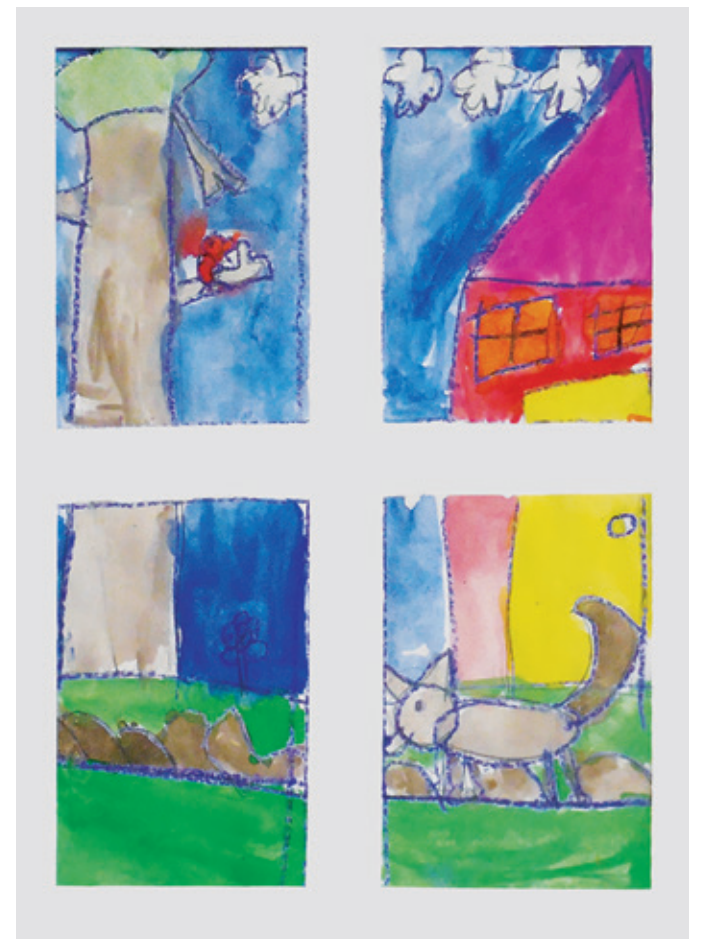
BEST OF SHOW: Luna Whitney, Wilkins – grade 1 / crayon and tempera