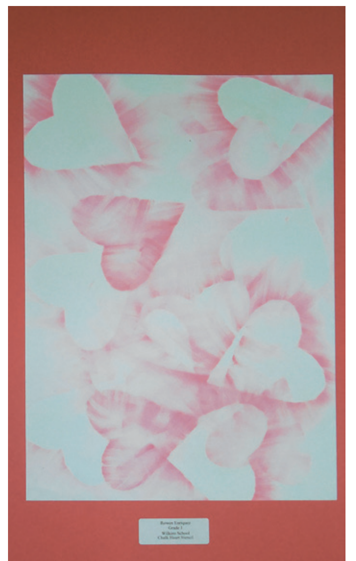
Rowen Enriquez, Wilkins – grade 1 / chalk art stencil