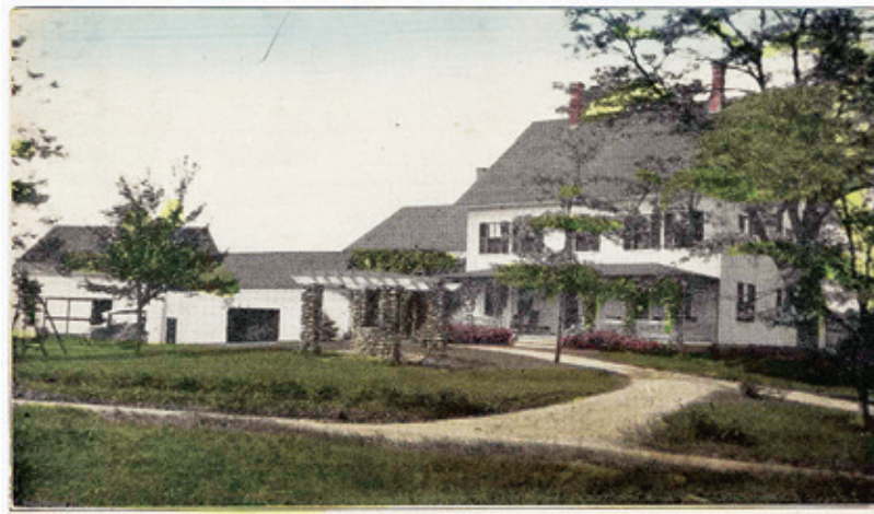
Published by G. F. Wenzel & Son Point of Pines House, Baboosic Lake, Amherst, N. H. Point of Pines hotel overlooking Baboosic Lake, Amherst, N.H., built in 1873 with four rooms downstairs and 12 sleeping rooms above; burned in 1939. Photo after 1914; postcard published c. 1930.

(Please be sure to call before registering. Day/Time must be verified with the farm.)