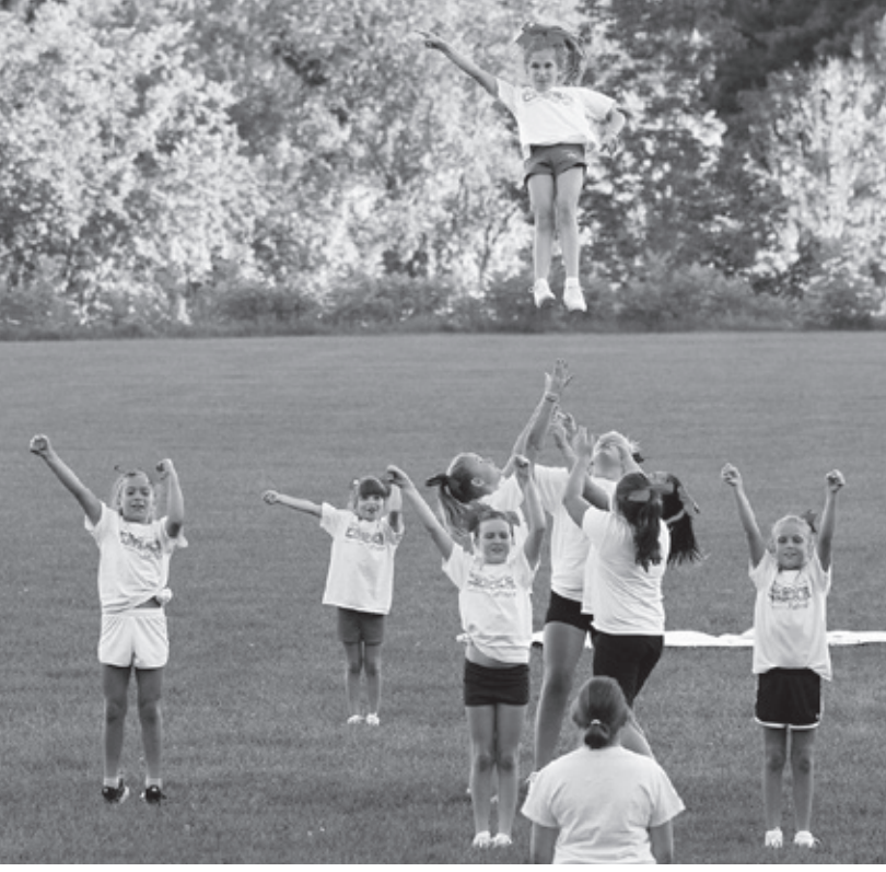
Cheer team practices their routines

munity found on the sidelines of practices and games. She went on to say: "I don't do this because I'm a huge football fan or cheerleader, I do this because I've never seen a more supportive community surrounding a youth athletic program. Thanks to all of you who make that happen." The highlights of the night included performances by all three cheerleading teams and each football team running through the Patriot's banner.