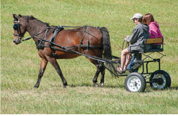
... for taking a horse ride around the farm...