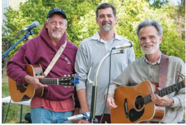
... for talented musicians to entertain the crowd...