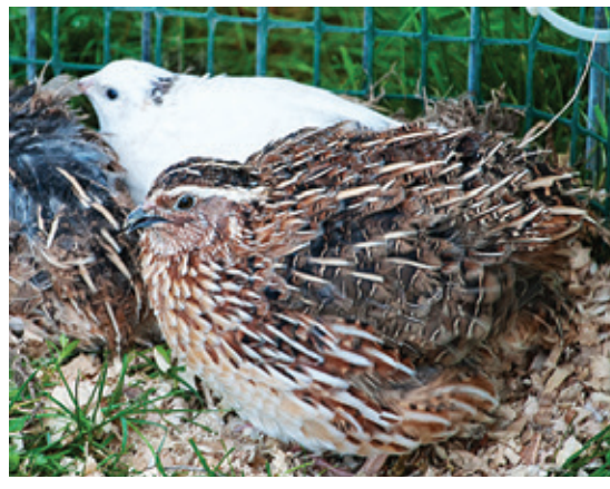
... and for farm animals to get some attention.