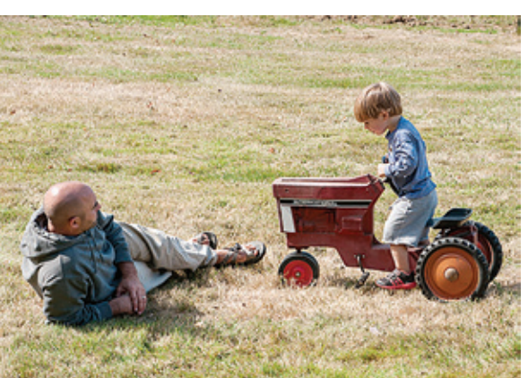
... for a dad to watch his son on an antique tractor...